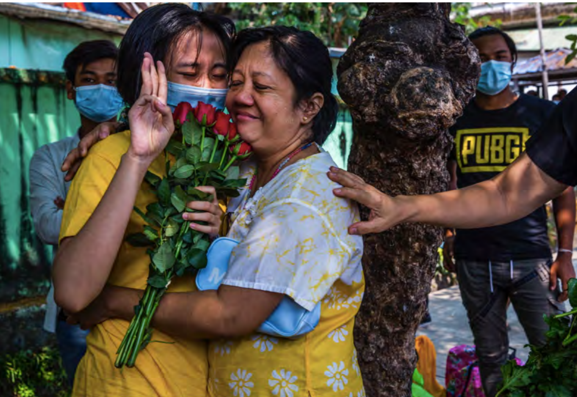
A protester released from prison after three weeks of detention makes a three-finger (pro-democracy) sign as she reunites with her mother in Yangon, Myanmar.