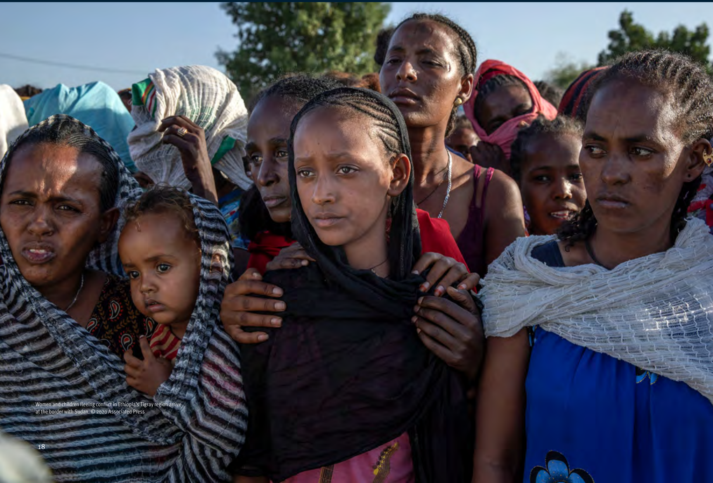
Women and children fleeing conflict in Ethiopia's Tigray region arrive at the border with Sudan.

These tactics are never 100 percent effective. But through careful fact-finding and strategic advocacy, a small group of people can raise the cost of repression and ameliorate suffering around the globe.