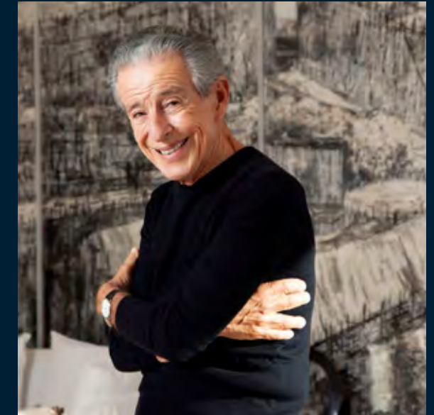
Jean-Louis Servan-Schreiber (1937-2020)