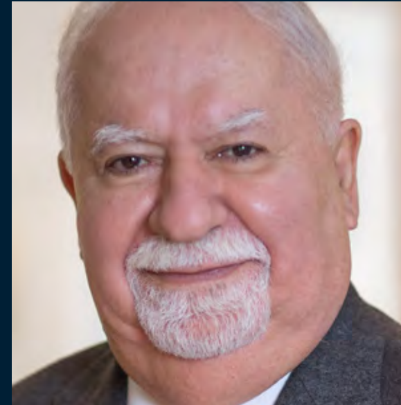
Vartan Gregorian (1934-2021)