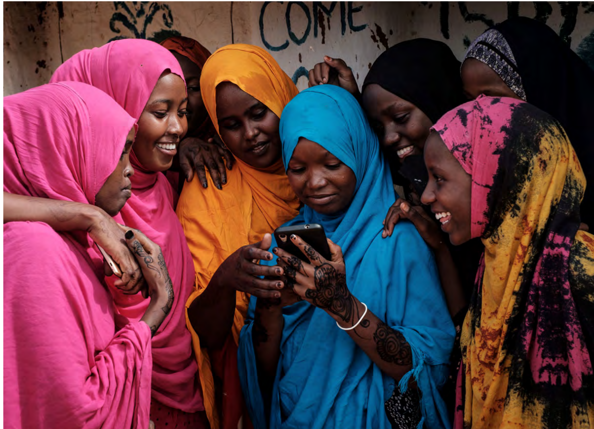
Young Somali women consult a smartphone at the Dadaab refugee complex in Kenya.